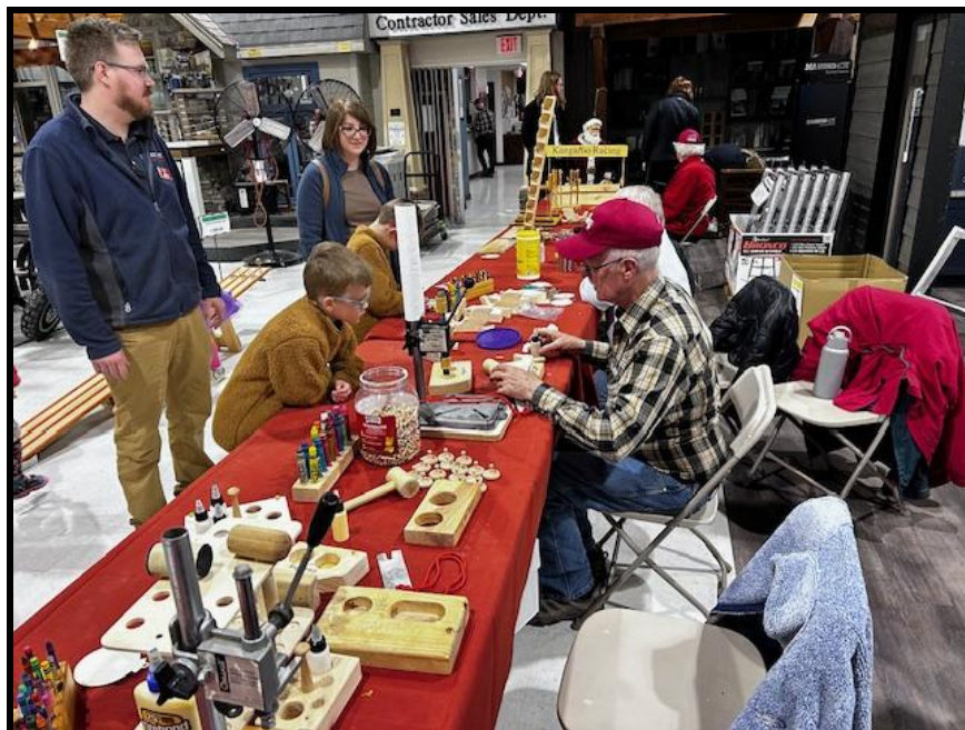
Wood Show 2024

Except for Jan-Mar, the RCWA meets on the 2nd Monday of the month at 7:00 p.m. on the main floor of the annex to OUR REDEEMER LUTHERAN CHURCH at 910 WOOD Avenue in Rapid City. Each general meeting has a theme with one main topic, which is presented and discussed. It’s a great opportunity to meet fellow woodworkers, share ideas, seek advice, and get out of the sawdust for a while. We cordially invite men and women of all ages who have any interest in woodworking, both hobby and professional, to attend our meetings.